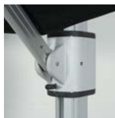
Heavy duty slider car