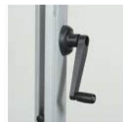
Easy winding handle

Available Australia Wide Check our website for a distributor near you www.instantshadeumbrellas.com.au