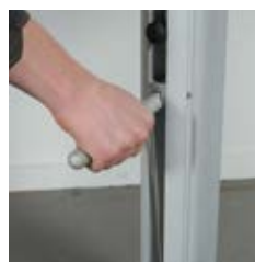
Easy rotational locking handle