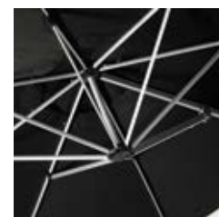
Marine grade aluminium struts